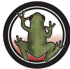
Amphibians (Frogs) Exodus 7:26-8:11