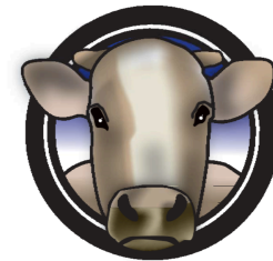
Disease on Livestock Exodus 9:1-7