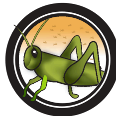
Locusts Exodus 10:1-20