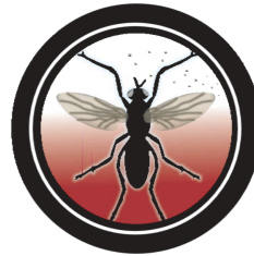
Gnats (Lice) Exodus 8:12-15