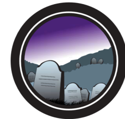
Death of First-Born Exodus 11:1-12:36