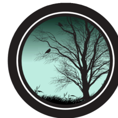
Darkness Exodus 10:21-29