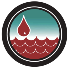
Waters Turn to Blood Exodus 7:14-25

Moses went back to Egypt and asked the Pharaoh to free his people. Pharaoh did not want to lose his slaves so he refused. God unleashed ten plagues on the Egyptians.