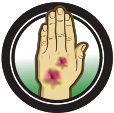
Unhealable Boils Exodus 9:8-12